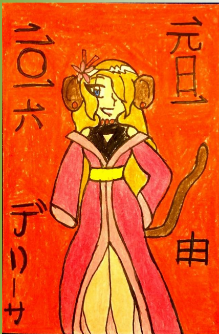
Delysa Huff -10th JP2