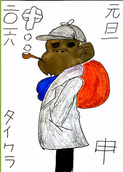
TyQura Fountain -12th JP5