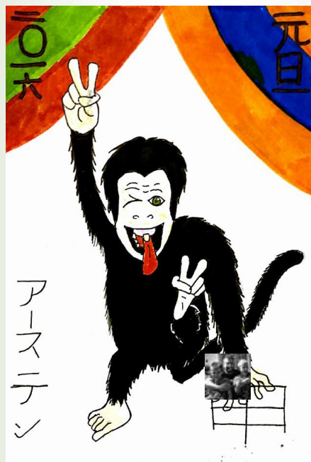
Austen Brown-11th JP3